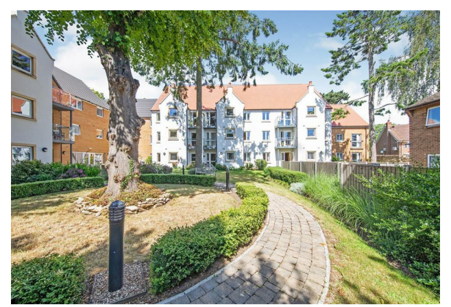
*JOIN US FOR FIZZ & CAKE - WEDNESDAY 8TH MAY - 10am - 4pm - BOOK YOUR PLACE TODAY!*

A bright and spacious one bedroom retirement apartment, situated in a beautiful town. ONE HOUR OF DOMESTIC ASSISTANCE INCLUDED PER WEEK. Personal care packages available from the onsite CQC registered care agency. ONE SITE RESTURANT WITH TABLE SERVICE.